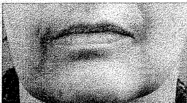
Ecchymosis after Vbeam Perfecta Tx

Due to its effectiveness in dissipating red blood cells and hemoglobin, the 595 nm Vbeam Perfecta pulsed dye laser from Candela Corporation (Wayland, Mass.) has established a new indication: treatment of ecchymoses after cosmetic procedures.